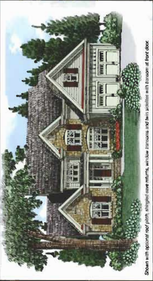
Shown with optional roof pitch, shingled eave returns, window transoms and twin shutters with transom at front door.