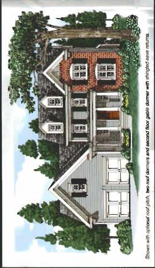
Shown with optional roof pitch, two roof dormers and second floor gable dormer with shingled eave returns.